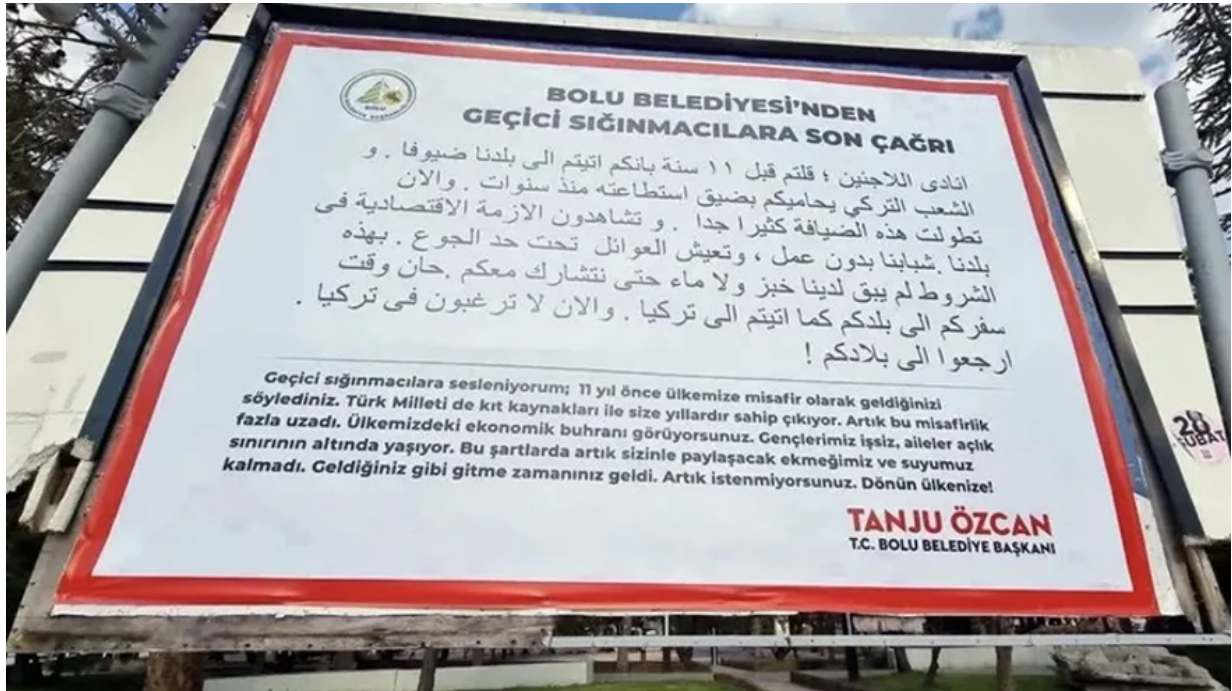
A billboard in Bolu

understand,” referring to the government’s Islamist roots and the Syrians, adding, “Enough is enough!!!”