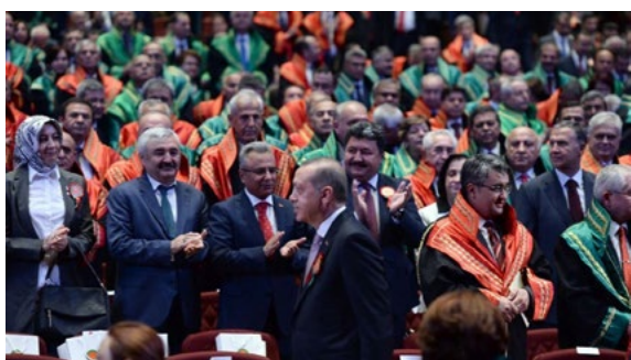
Judges and prosecutors stand up to welcome President Erdoğan

No. 6572 dated December 2, 2014, which included disciplinary amnesty for members of the judiciary covering the 2005-2013 period, was enacted by lawmakers of the AKP. 141 The disciplinary misconduct of about 1,500 judges and prosecutors was pardoned under this law as had been promised by the government as part of its judicial election promises. 142 The salary increase promised by the justice minister was also realized in this connection. 143 Just after the judicial election, Law No. 6572 was adopted, on December 12, 2014, which increased the number of chambers and members in the Supreme Court of Appeals and the Council of State. 144