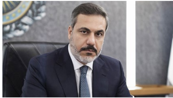
Hakan Fidan, head of Turkey's National Intelligence Organization (MIT)

and parts of the judiciary that enjoy the backing of the Gülen movement. 48