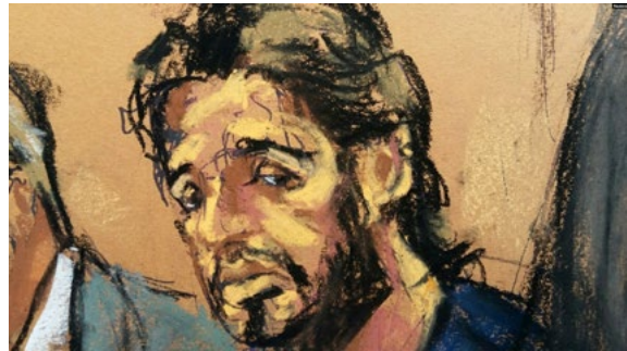
Reza Zarrab appears in a courtroom sketch.

December 25, 2013. 71 Bayraktar expressly said in a live televised statement he made to NTV that “a great majority of city development plans in the investigation file were done upon the instructions of Mr. Prime Minister ... so Mr. Prime Minister should also resign,” implying that Erdoğan himself must be included in the investigations. 72