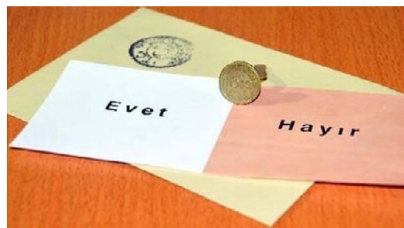
Ballot used in the constitutional referendum.

The Judicial Council as well as the Constitutional Court were the subject matter of radical change and heated debate in the constitutional amendments of 2010 initiated with the support of the AKP majority in parliament and adopted in a referendum on September 12, 2010. 14 The