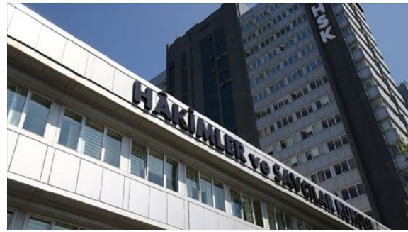
The Council of Judges and Prosecutors, Ankara

This report begins by highlighting the developments following the referendum of 2010 in respect to the amendments regarding the composition and powers of what was then called the High Council of Judges and Prosecutors (HSYK). It then moves on to examine the impact of the December 2013 corruption investigations on the re-designing of the structure and powers of the HSYK by