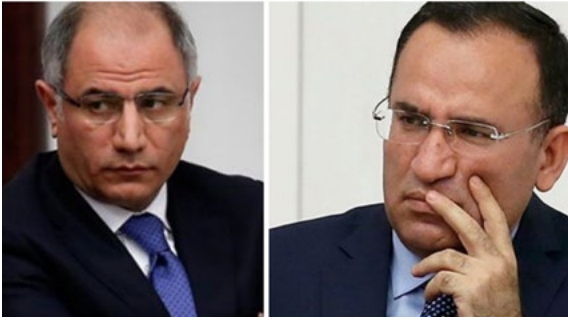
Interior Minister Efkân Ala and Justice Minister Bekir Bozdağ

Erdoğan and his government to overcome this threat in the aftermath of the December 2013 corruption investigations. In addition to taking swift actions for the required legislative and administrative overhaul, Erdoğan was desperately in need of making new political and bureaucratic alliances within both the judiciary and the security forces.