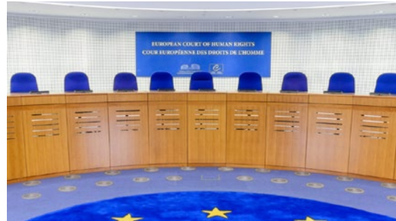
The European Court of Human Rights

Court of Appeals, the suspicion of membership in a criminal organization could be sufficient to characterize a case of discovery in flagrante delicto without the need to establish any current factual element or any other indication of an ongoing criminal activity.