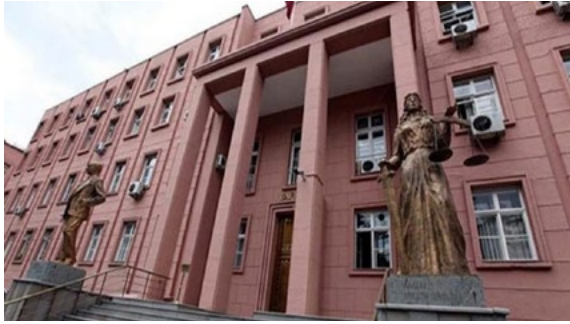
Turkey's The Supreme Court of Appeals (Yargıtay), Ankara