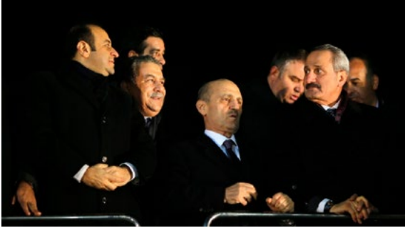
(From left) Bağış, Güler, Albayrak and Çağlayan in a rally with Erdoğan hours before their resignation.

doings.” 70 Erdoğan was clearly making a request of the president of the HSYK’s First Chamber to interfere with an ongoing criminal prosecution of his government ministers and his own son.