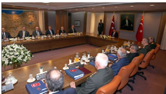
A National Security Council (MGK) meeting presided by then-President Abdullah Gül

strong instrument of control over the ruling AKP in the event of its “deviation” from what is considered to be “state policy.”