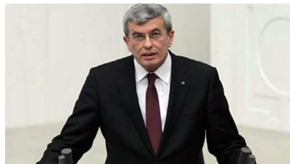
Undersecretary of the Ministry of Justice Kenan İpek

be formed in accordance with constitutional rules. A judicial election for the new HSYK was held on October 12, 2014 under extraordinary circumstances. After the HSYK reshuffling of January 15, 2014, this election was watched with interest almost equal to that of a parliamentary election since the results would be critical in determining the extent of the Erdoğan administration's future interference with judicial independence. 120