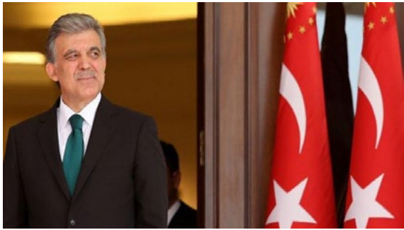
Abdullah Gül, 11th President of Turkey